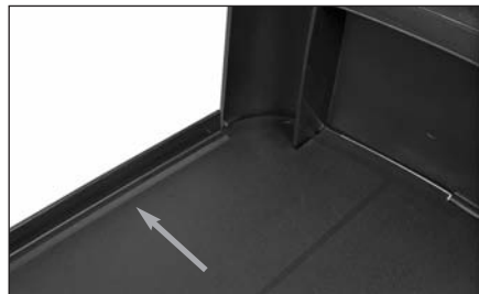
Detail of retaining ledge on middle shelf