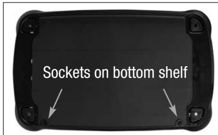
Sockets on bottom shelf

1.) Position fully assembled Cart on its back (back is determined by finding the side with the retaining lips on all three shelves). Accessory components should be added with the Cart resting on a carpeted area or other soft even surface. If necessary, flatten the box the Accessory Kit came in and place under Cart.