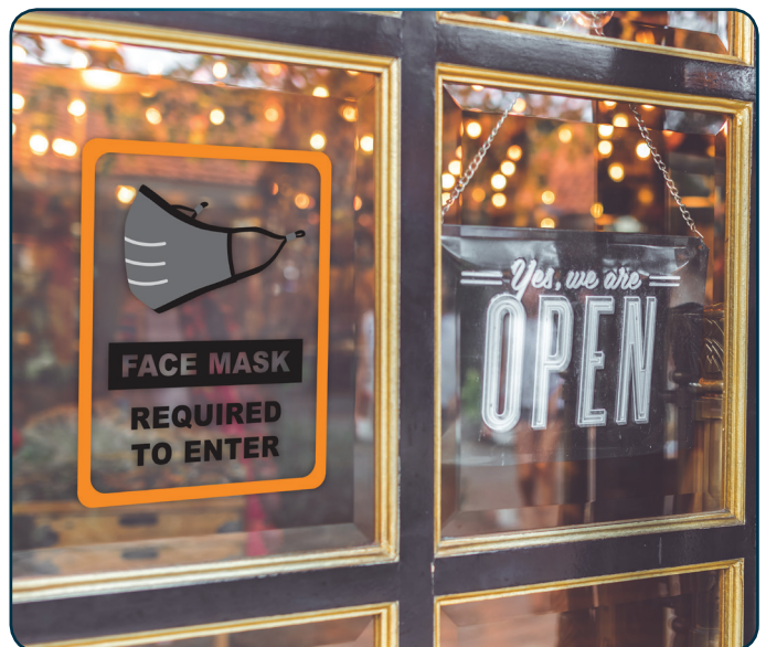
Clings to storefront window to advertise health practices.