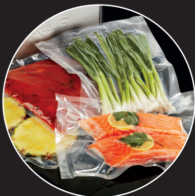
Package Fresh Meats, Soups, Marinades and Stews