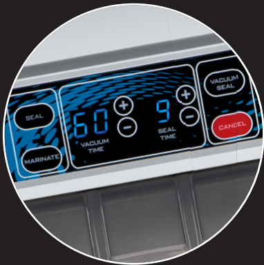
User-Friendly, Easy-to-Clean Touchpad Controls