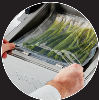
11" Seal Bar Double-Seals Pouch