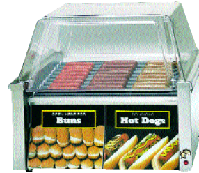
Model 30SCBD with Sneeze Guard