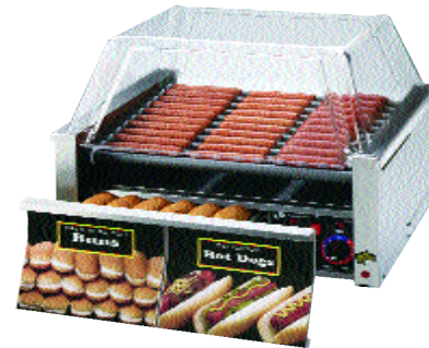
Model 50CBD with Sneeze Guard