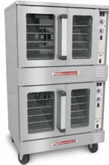
(shown with optional casters)