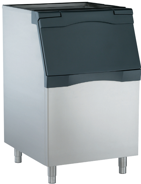
B530S shown with optional KLP8S legs