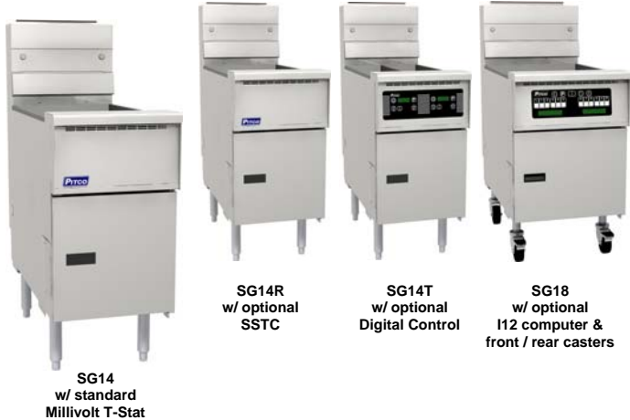
SG14 w/ standard Millivolt T-Stat

For High Production Gas frying specify Pitco Solstice Gas Models SG14, 14R, 14T or SG18 tube fryers with the patented Solstice Burner Technology. The dependable blower free atmospheric heating system provides fast recovery to cook a variety of food products. The Solstice gas fryer comes standard with a millivolt thermostat, for melt cycle and boil mode choose the optional quick responding solid state thermostat with the matchless ignition system. The optional digital control and the elastic time computer are available and can be used with our optional labor saving highly reliable basket lift system. The patented self cleaning burner and down draft protection keeps your fryer tuned up for peak daily performance.