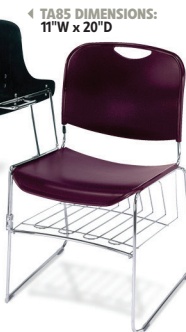
MODEL 8508 W/TAB5R AND BR85 The 8500 Series chair with the optional R/L Tablet and Book Rack