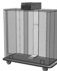
Standard Electric Thermal System