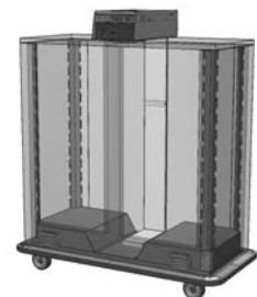
Quad-Heat™ Dual Fuel Thermal System