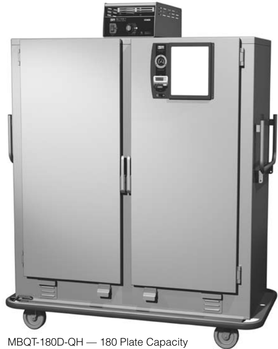
MBQT-180D-QH — 180 Plate Capacity with Quad-Heat™ Dual Fuel

Energy Star: All Metro Heated Banquet Cabinet models are Energy Star.