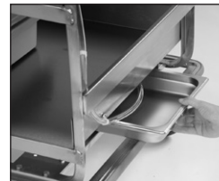
Drain Pan Holder