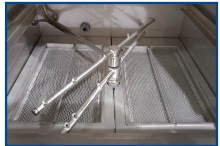
Interchangeable Scrap Baskets