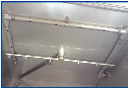
Halo Wash Arm