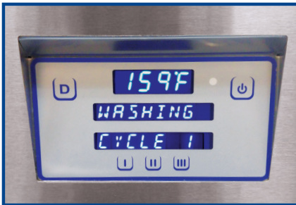
Digital LED Temperature Display