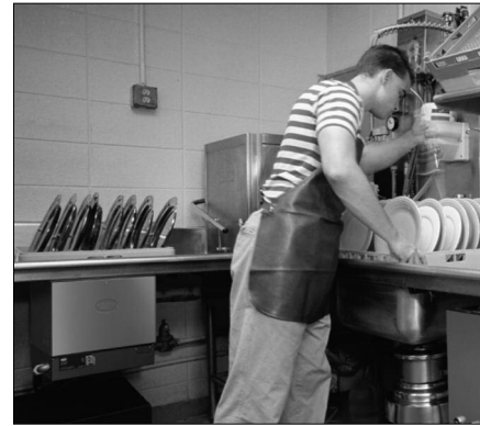
Water Temperature Recovery Table