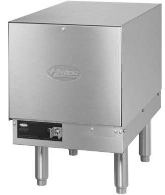
Model C-18 with optional 6" (152 mm) stainless steel adjustable legs