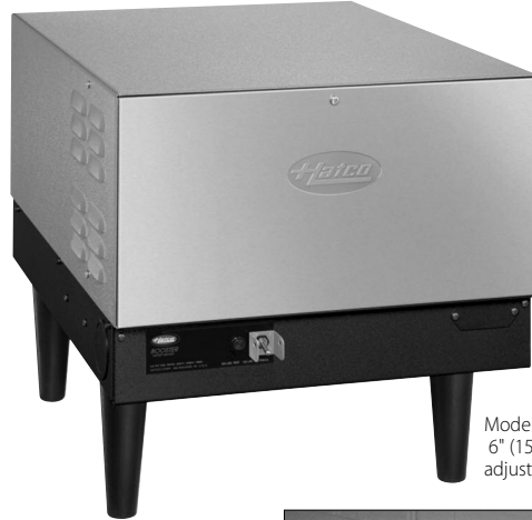
Model C-45 with 6" (152 mm) adjustable legs