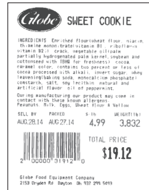
Ingredient Label (E13) Actual size: (2.3" x 3.35") Prints 14 lines, 46 characters/line