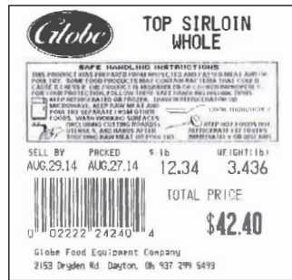
Safe Handling Label (E12) Actual size: (2.3" x 2.3")