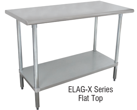
ELAG-X Series Flat Top

Item #: _____ Qty #: _____ Model #: _____ Project #: _____