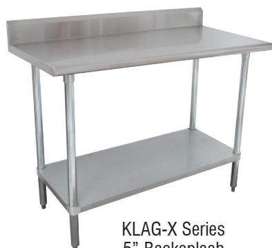
KLAG-X Series 5" Backsplash