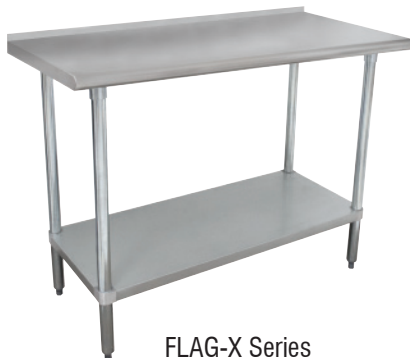
FLAG-X Series 1 1/2" Backsplash