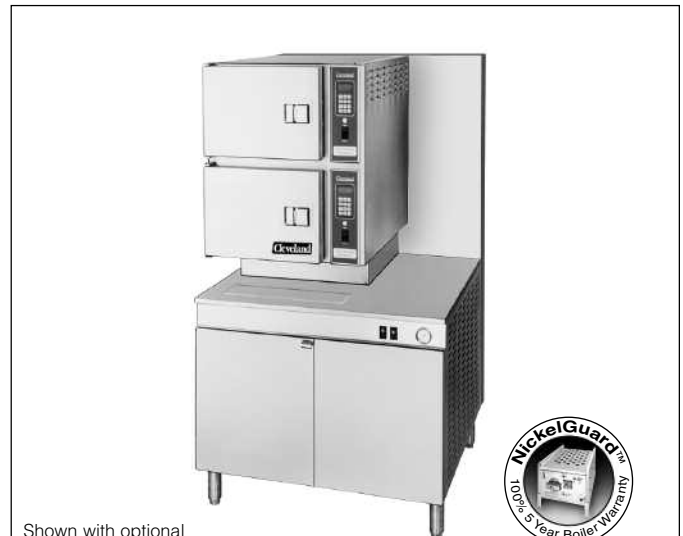
Shown with optional Electronic Timer