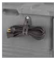
Removable cord stows securely for transport.

Tough, polyethylene exterior stays cool to the touch.