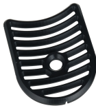
COVER, DRIP TDO-N