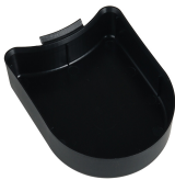
CHAROLA DE GOTEIO