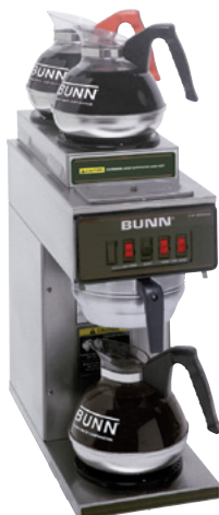
Model CWT35-3T (decanters sold separately)