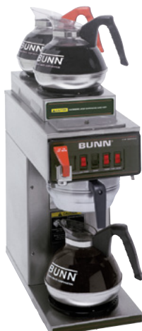
Model CWTF35-3T (decanters sold separately)