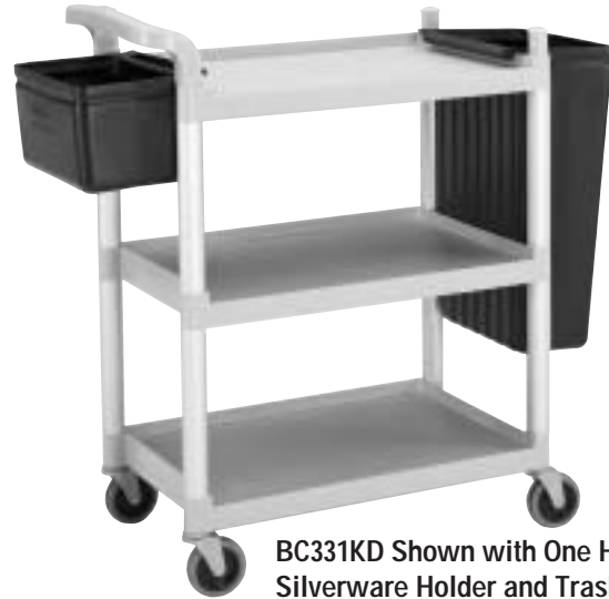
BC331KD Shown with One Handle, Silverware Holder and Trash Container (Plugs are used in place of other handle)