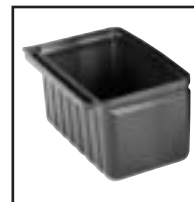
2.5 Gallon (9,5 L) Silverware Holder