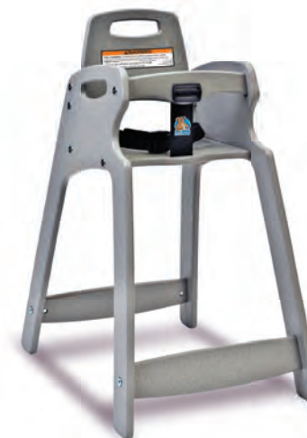
Eco High Chair KB833

Koala Kare also plans to introduce more chairs that meet the standard prior to June 2019. Check www.koalabear.com/getready often for updates on compliant chairs.