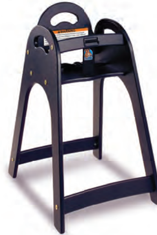
Designer High Chair KB105