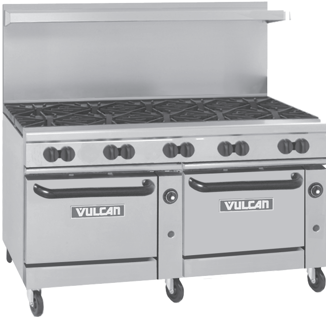
Model 60-SC-10B-N (shown with optional casters)