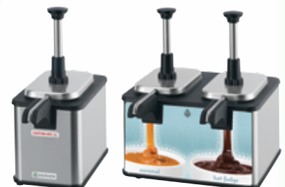
EZT-S & EZT short models

Models accommodate large and small operations, serving 1 or 2 toppings with or without the ability to pre-heat a reserve pouch; single unit also available without spout heater.