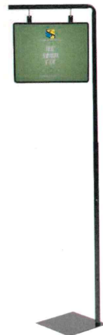
PALLET SIGN HOLDER