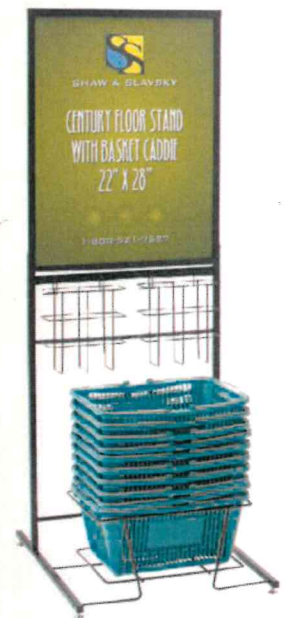
THE CENTURY W/ BASKET