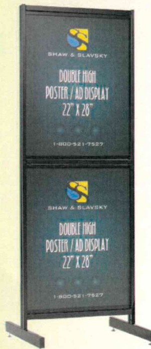
DOUBLE HIGH AD DISPLAY