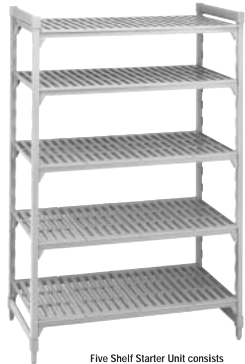
Five Shelf Starter Unit consists of two Post Kits and five Vented Shelf Kits.