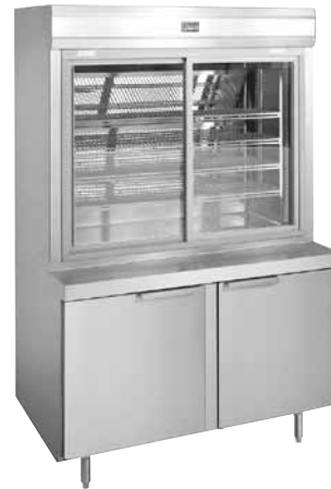
model 43250 shown

REFRIGERATION: Base and upper structure supplied with separate refrigeration coils. Expansion valve and refrigeration lines provided and installed for connection at PNL area (specify refrigerant if other than R-134a). Condensing unit not provided.