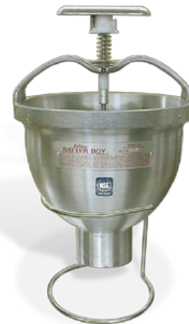
Type 'G' Batter Boy Depositor