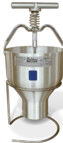
Type 'K' Donut Depositor Type 'K' Hushpuppy Depositor