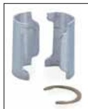
Aluminum Split Sleeves

Bag of four aluminum sleeves with C-rings.