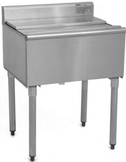
#B21C-18 ice chest

Eagle 1800 Series Ice Chests, model _____. Top, front, backsplash, ice bin and sliding cover to be heavy gauge type 304 stainless steel. Fabricated ice bin is fully insulated with 1½" drain. 1½" O.D. galvanized tubular legs with adjustable bullet feet.