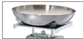
Optional spider and bowl assembly