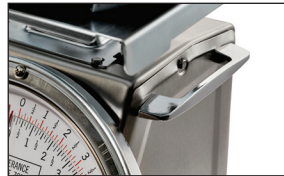
Optional carrying handle