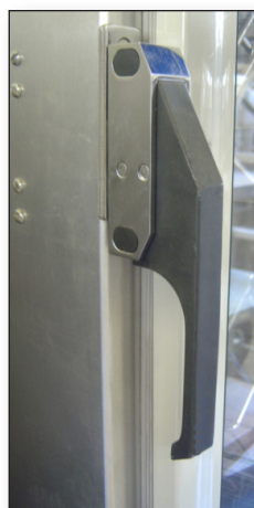
Magnetic Door Latch