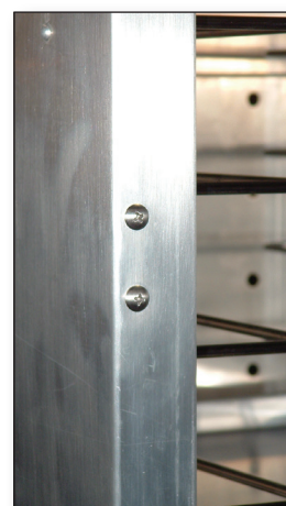
Field Reversible Door Mount