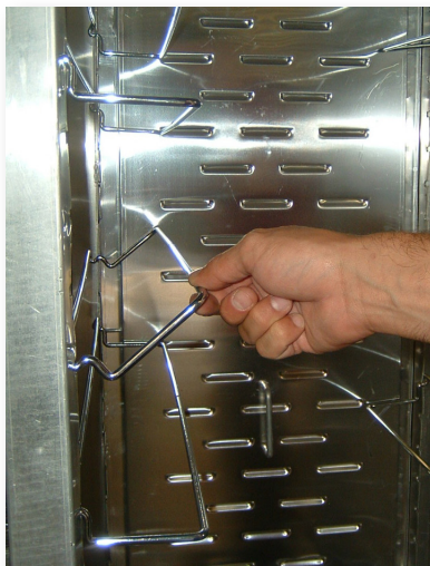
Adjustable Universal Runners Holds a variety of pan configurations.

Option: Additional runner slide (1) NHPL-1825-UN-Runner (657150)