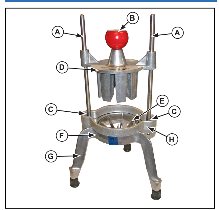
Figure 1. Features and Controls.