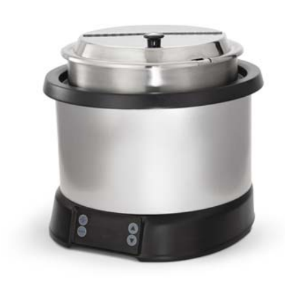
Mirage<sup>®</sup> Induction Rethermalizer