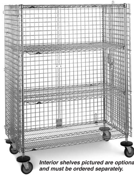
Interior shelves pictured are optional and must be ordered separately.