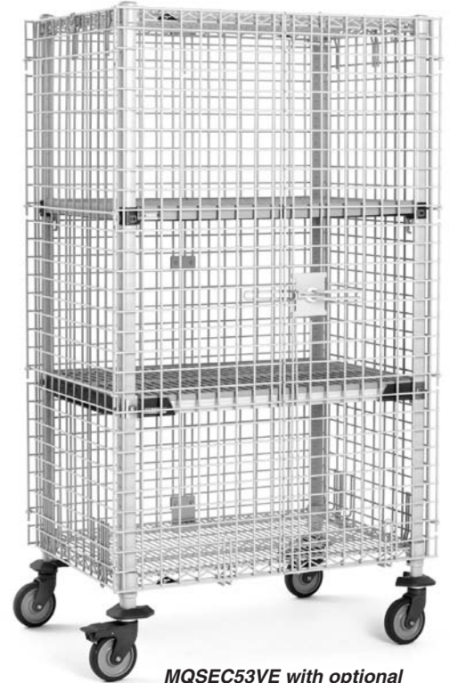
MQSEC53VE with optional intermediate shelves

Note: Leveling foot on post can be adjusted up to 1" (25mm) to compensate for uneven floors.