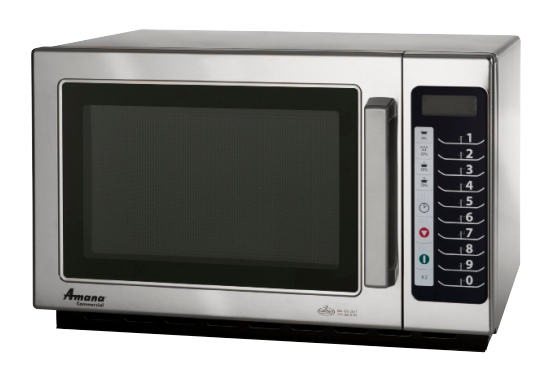
Model RCS10TS shown