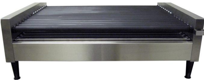
Roller Grill with control cover