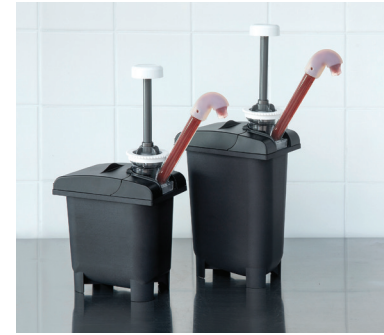
Topping Pumps are designed for use with 48 or 64 oz pouches with 16mm fitments or 7–10" fountain jars.