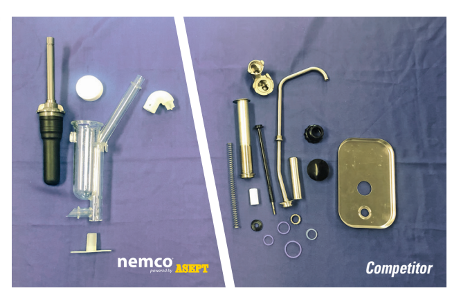
Cleaning and reassembly is easier and faster than ever! Nemco's Topping Pumps work flawlessly using less than a third of the parts found in alternative models on the market.