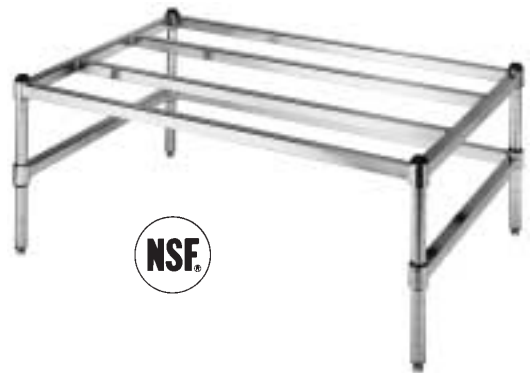
Stationary Dunnage Racks Without Mat