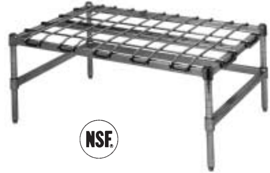
Stationary Dunnage Racks With Mat