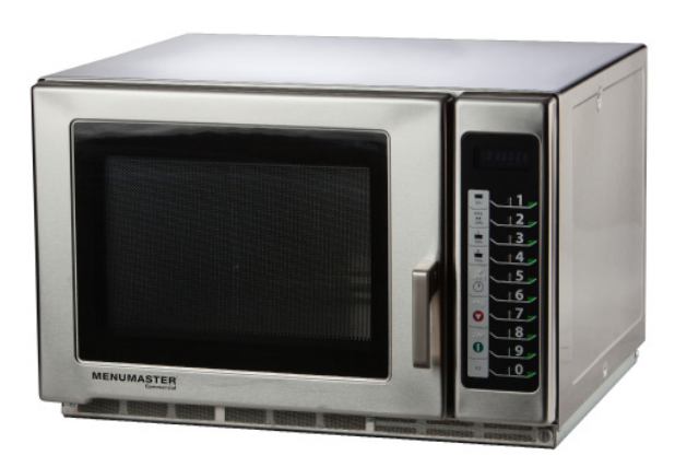
Model MFS12TS shown