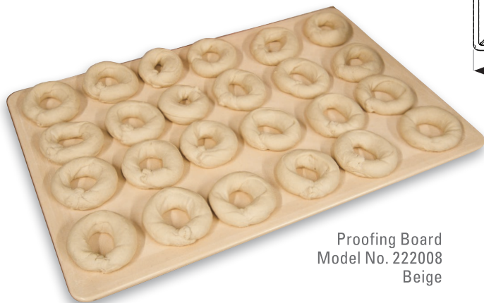
Proofing Board Model No. 222008 Beige