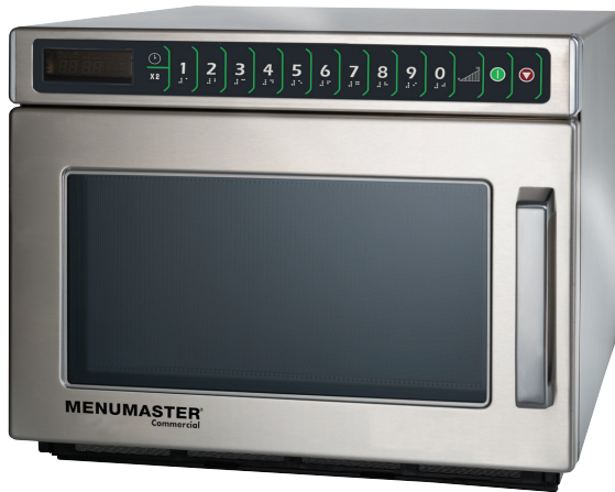
Model MDC182 shown