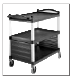
Shelf Panel Set (includes 1 Side Panel and 2 End Panels)