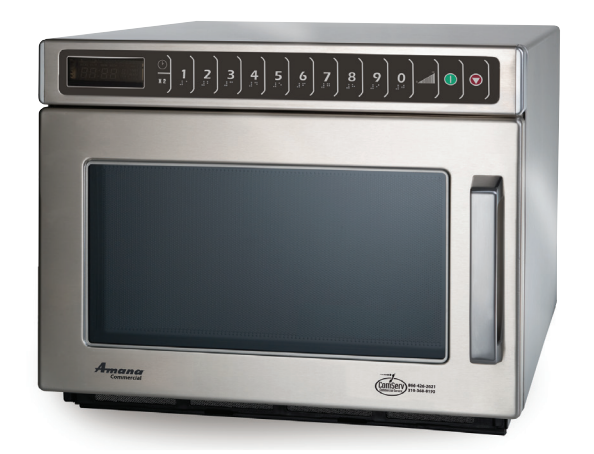
Model HDC12A2 shown