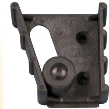
Gripit® Standard Tool Holder Holds Handle Diameters Up To 1 3/16"

Installed on any wall in minutes, Gripit® saves time, ends clutter, and makes it easy to find tools fast. Designed for mops, brooms, hammers and other tools. Simply push the tool handle against Gripit®, and the roller, with a high friction surface, automatically adjusts to lock it securely. To remove the tool, lift the handle slightly and it's free.