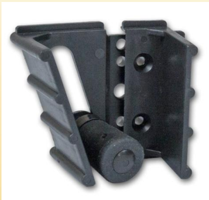
Expando Gripit® Tool Holder Holds Handle Diameters Up To 2"