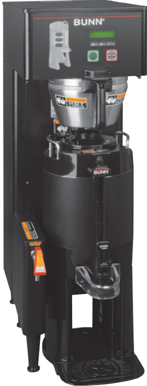
Single TF DBC with TF Server