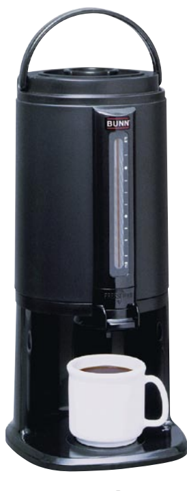
Thermal Server Dimensions: 19.6" H x 7.9" W x 8.7" D (49.8cm H x 20.1cm W x 22.1cm D)