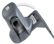
WATER FILTER HEAD, EQHP-VHD