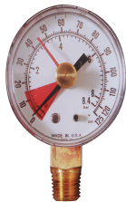
GAUGE, WATER FILTER EQHP