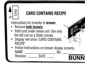
CARD ASSY, RECIPE TRANSFER(BRW)