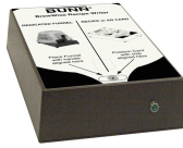
BREWWISE RECIPE WRITER