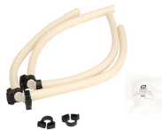
TUBE KIT, .188 PUMP LCC/LCA