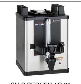
SH-S SERVER 1G 60 MIN ADJ TMR