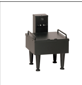
1SH STAND,120V BLK