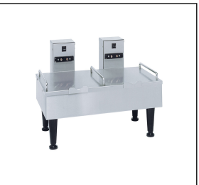
2SH STAND, 120V