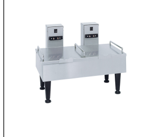
2SH STAND, 120V