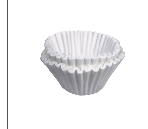
FILTERS, GOURMET 500 500/1 50/CL