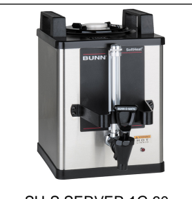
SH-S SERVER 1G 60 MIN ADJ TMR