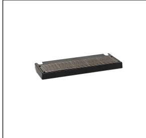
CHAROLA CON ACCESORIOS